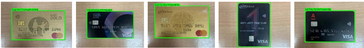
Figure 1 - An example of frames of a video sequence

According to the results obtained using the ROC analysis, after setting the optimal coefficients and threshold values in the implementation of the algorithm, the proportion of truly positive classification of all data fields on the card is TPR = 0.88 , and the proportion of false-positive classification is FPR = 0.14 . Figure 1– 3 shows examples of bank card detection from a set of video sequences, indicating keyframes and detection diagrams. Card detection on the diagram corresponds to – 1, absence – 0. Video capture was carried out at a constant frequency of 30 frames / s.